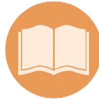
Discovery Bible Study Group