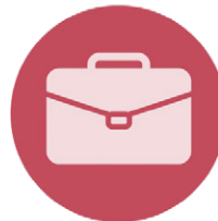
Work Related Life Group