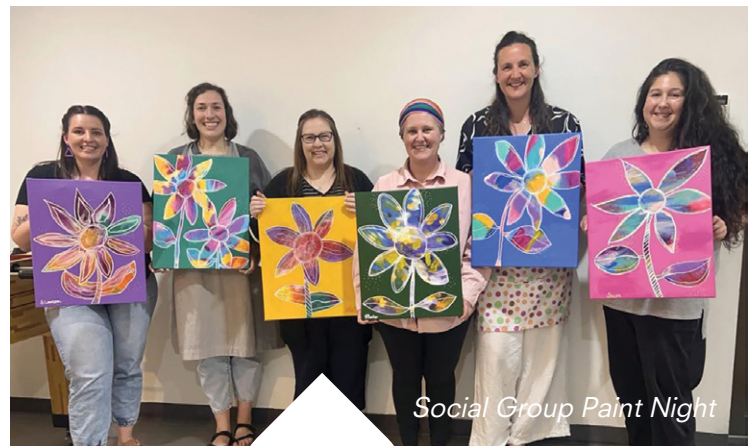
Social Group Paint Night